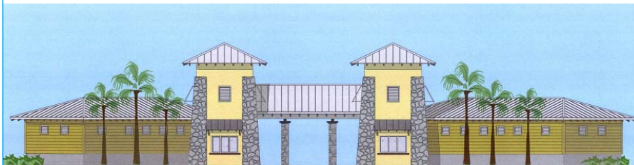
Conceptual Rendering of Water Park Entry Building

This 13-acre active park located just south of the Miami Airport will be transformed in three phases.