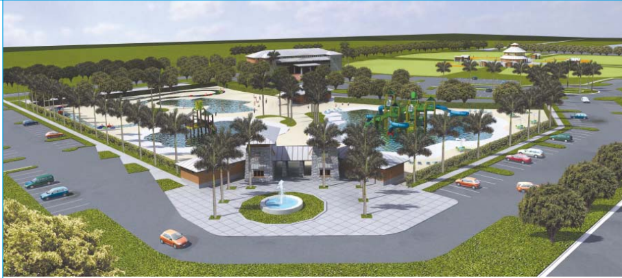
Conceptual Aerial Rendering