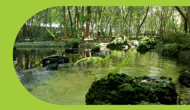
In 1920, a man made two-tiered freshwater pond was constructed as a special feature in the park.

Hammocks are ideal for tropical and temperate plants. Plant diversity supports an array of wildlife. Shaded from the sun by the tall trees, ferns and air-plants thrive in the moiste-laden air of these hammocks.