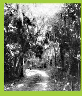
Trail running through Brickell hammock c. 1896